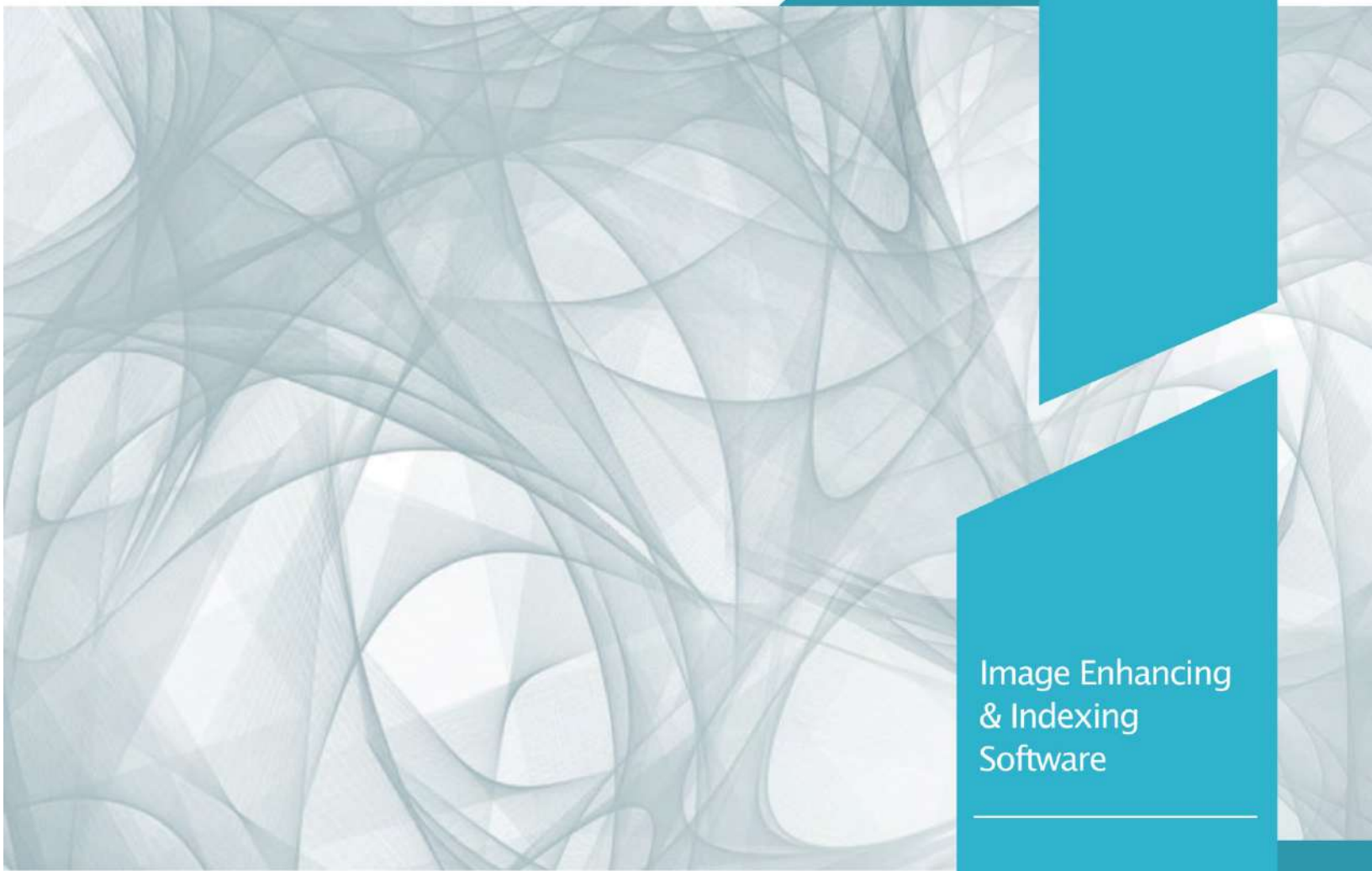
Image Enhancing & Indexing Software