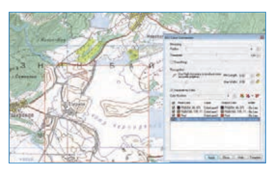
Colour raster to vector conversion