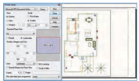
Print Setup and Layout