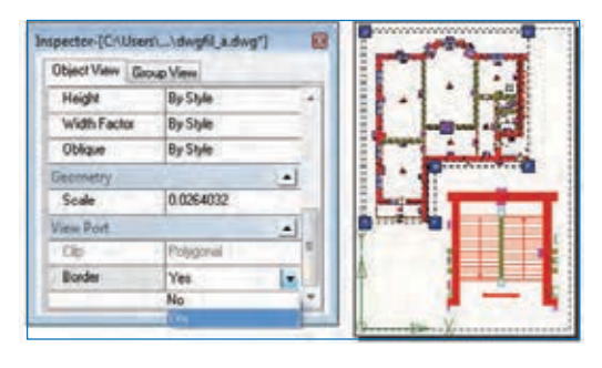
Viewport with polyline contour